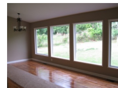
Beautiful hardwood flooring and panoramic windows