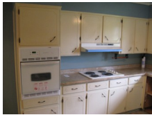
An ATG Services kitchen makeover

“Providing residential and commercial properties and services the right way”