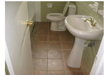
Beautiful bathroom completed by ATG Services

We are headquartered in the heart of Birmingham, Alabama, at 1527 5th Avenue North. It is our pleasure to serve you in ways that benefit you. To set up an appointment with ATG Services, give us a call at 205-623-0666.